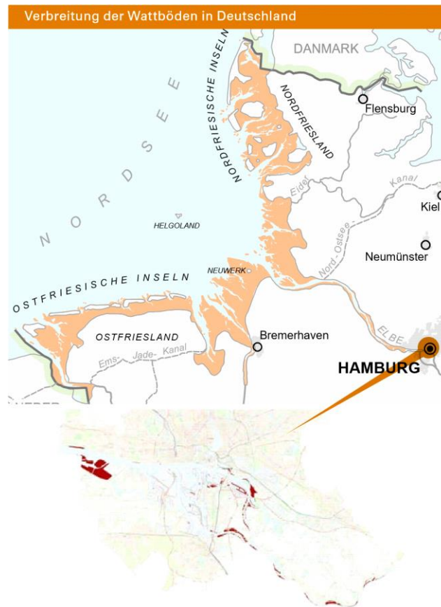
Distribution of intertidal flat soils in Hamburg