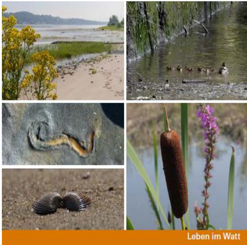
Live on the intertidal flats

Plants and soil organisms on the intertidal flats are subject to permanent alternation of falling dry and flooding, erosion and deposition of sediments, fluctuations of the water and soil temperatures, and are exposed to currents and waves. During low tide, they are affected by sun, wind and rain, during high tide they are translocated by the water current. In addition, the salt content of the intertidal soil significantly determines the colonisation by soil organisms and plants. The salt concentration in soils of marine intertidal flats, is about 35 grams per litre soil water, while in the fluvial area it is about 0.5 grams per litre only. While one may believe these extreme conditions are hostile to life, intertidal flats are actually quite species-rich.