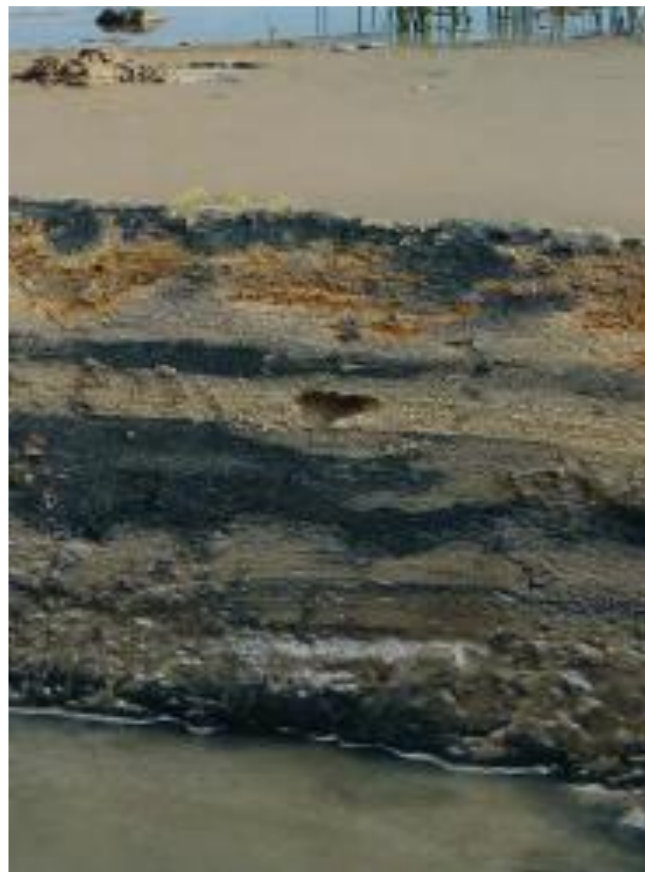
Sand estuarine tidal flat soils, Neßsand