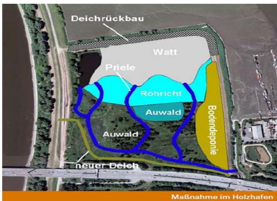
Exemple for rehabilitation

The area on the southern river banks of the timber harbour in Hamburg was dyked until 2008. The dyke was dismantled as a compensation measure for the extension of the motorway A1. Through the relocation of the old dyke, 18 ha tidal flats, important resting and foraging grounds for species like common teal, shelduck and the rare northern shoveler, and areas for tidal floodplain forests and reedbeds were newly formed.