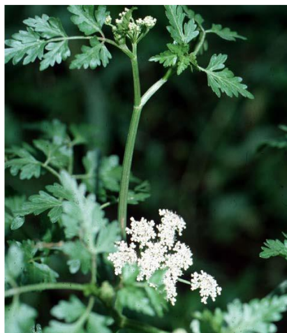
Oenanthe conioidea (Schierlingswasserfenchel)

Due to periodic inundations, permanent redistributions of sediments and wave strains, intertidal flats are suited to be priority areas for nature and species conservation. As the borderland between land and the sea, they provide an ecological niche and hence habitat for many rare and often highly specialised plant and animal species. A large part of the intertidal flats cannot be used directly by man and is left undisturbed for longer time periods.